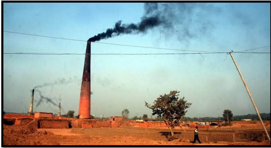
Figure 1: Air pollution from red brick kiln